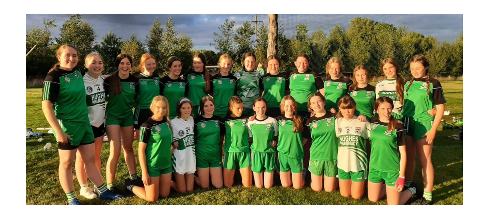
Portlaoise U15 Camogie Feile Team - Laois Feile 2021